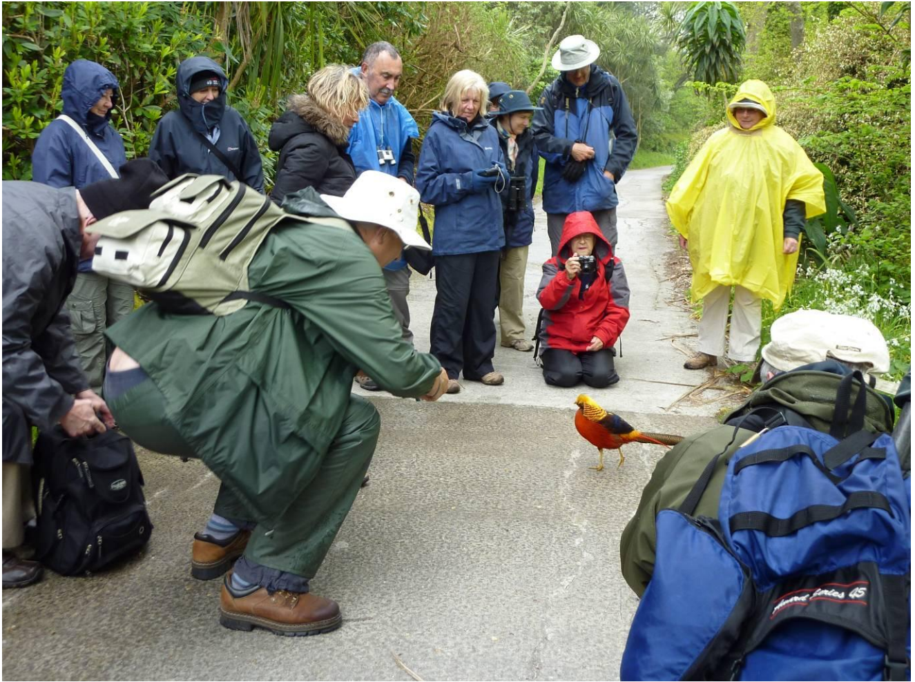
Golden Pheasant (above), Grey Seal (below left) and Common Dolphin (below right)