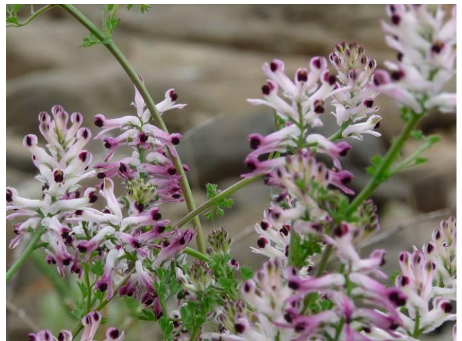
Clockwise from top left: Suffocated Clover, Sea Pea, Western Fumitory & Spring Squill