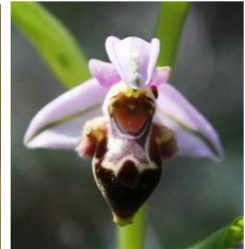
O. lapethica skinny waist