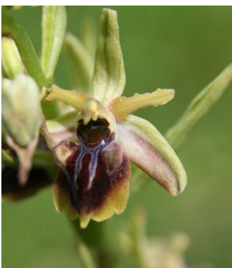
Ophrys alasiatica brown 'throat', pale lip margin