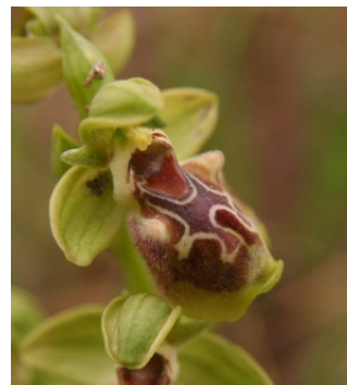
O. flavomarginata yellow margin to lip, flared forward