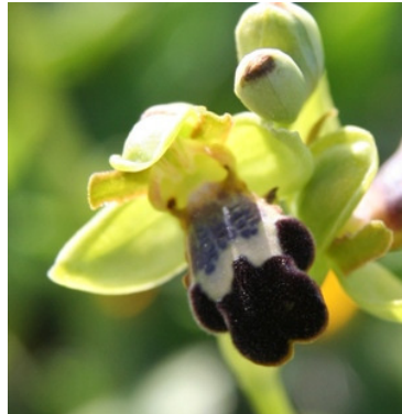
O. israelitica no V-groove in throat, white W