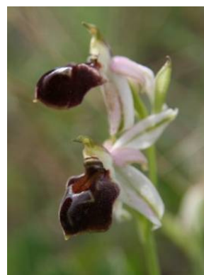
O. elegans sepals swept back, goggles