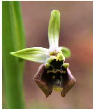
O. bornmuelleri short 'ears', lip flared forward