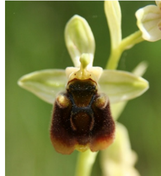
O. levantina short 'ears' lip curled back