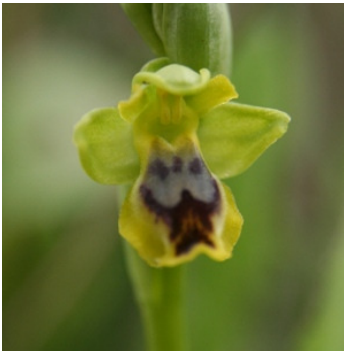
Ophrys sicula the yellow one

The largest and most confusing group of orchids is the genus Ophrys , the 'bee orchids'. With up to 16 species found on Cyprus (of which we found 13) this can be a very confusing group! Luckily, they fall into several smaller 'bite size' groups which make the genus much more manageable.