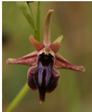
O. morio purple-black 'throat'