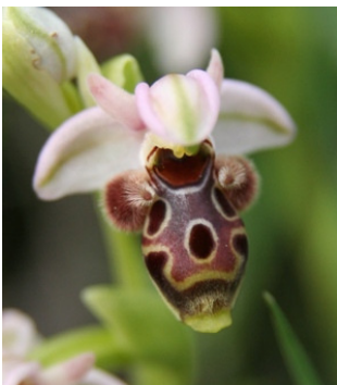
Ophrys umbilicata pink sepals, lip tucked under