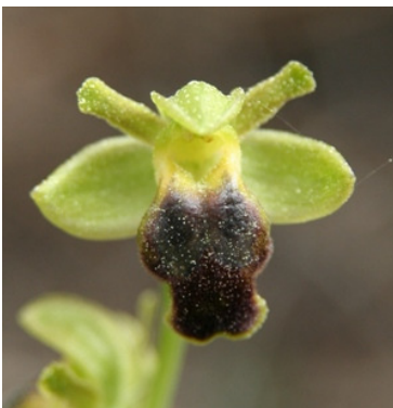
Ophrys fusca V-groove in 'throat', yellow margin