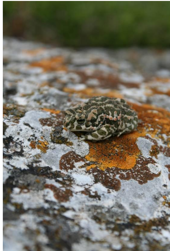
Green Toad, Yailata