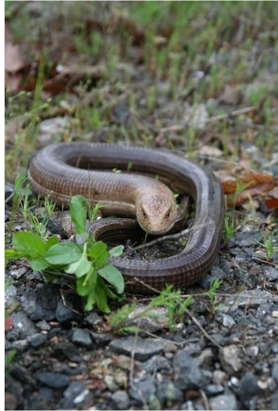
European Glass Lizard, Alepu